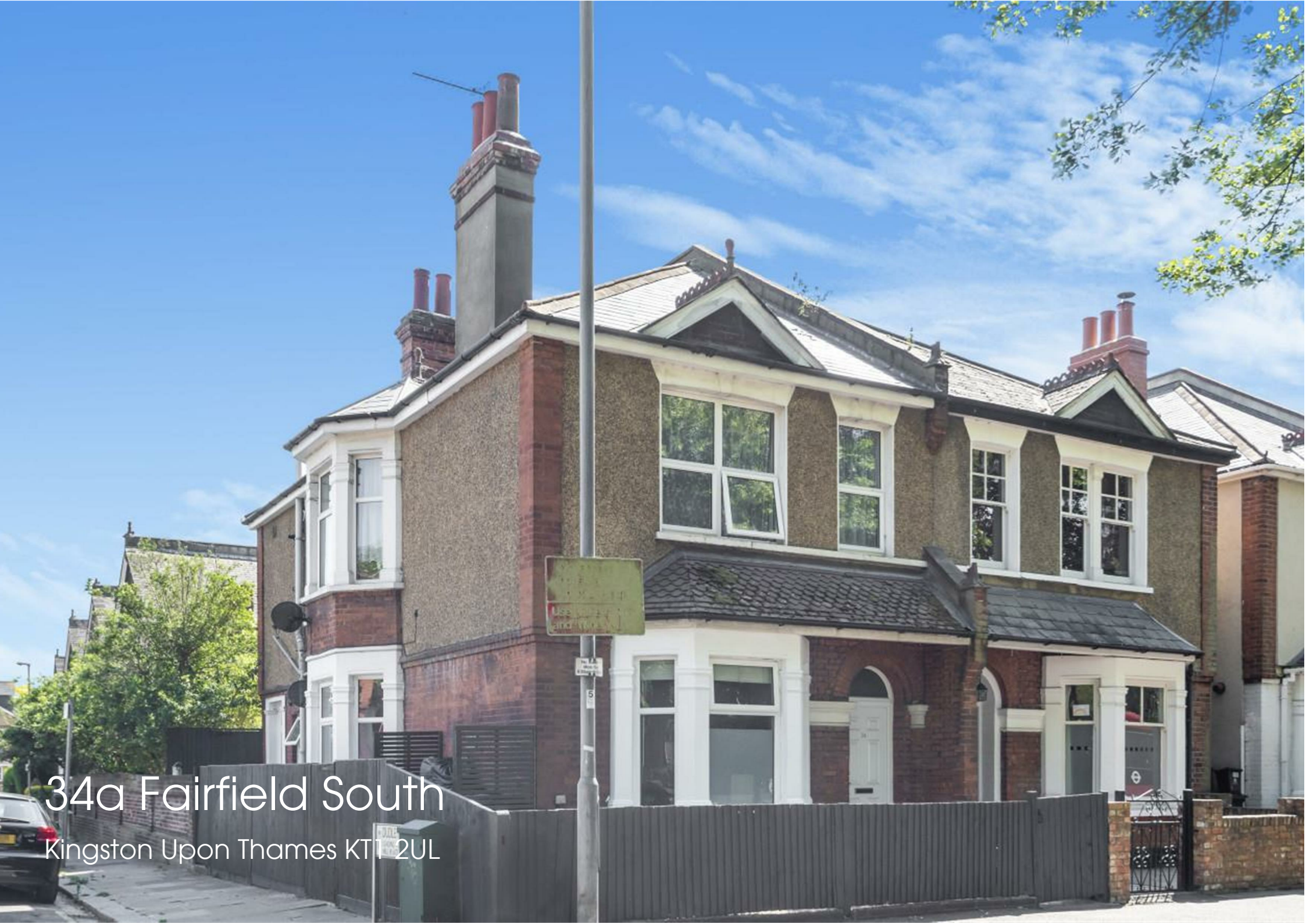
34a Fairfield South Kingston Upon Thames KT2 2UL